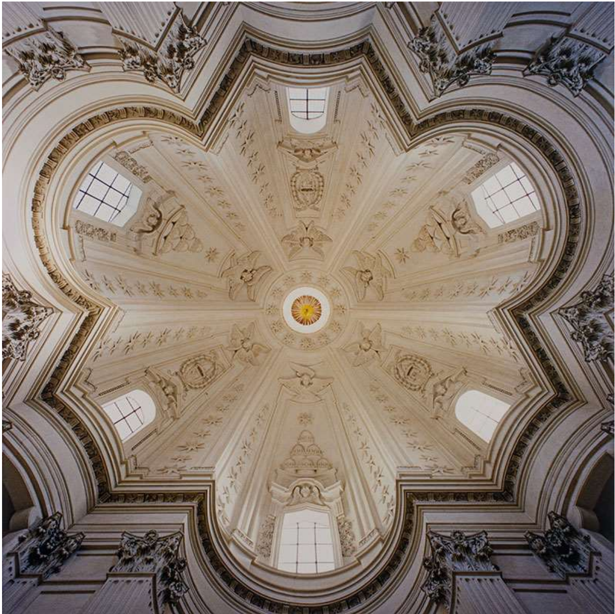
David Stephenson (USA, Australia, 1955–) 20106 Sant'Ivo alla Sapienza, Rome, Italy, 1642–1650, Francesco Borromini 1997, printed 2016 from the series "Domes" pigment print, edition 2/5 101.5 x 101.5 cm Collection of The University of Queensland, purchased 2016. Reproduced courtesy of the artist and Bett Gallery, Hobart.